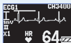
When the ECG is displayed

It makes it easier to check pre-inspection information such as the waveform, lead condition, remaining battery level, transmission channel and so on, once electrodes are attached.